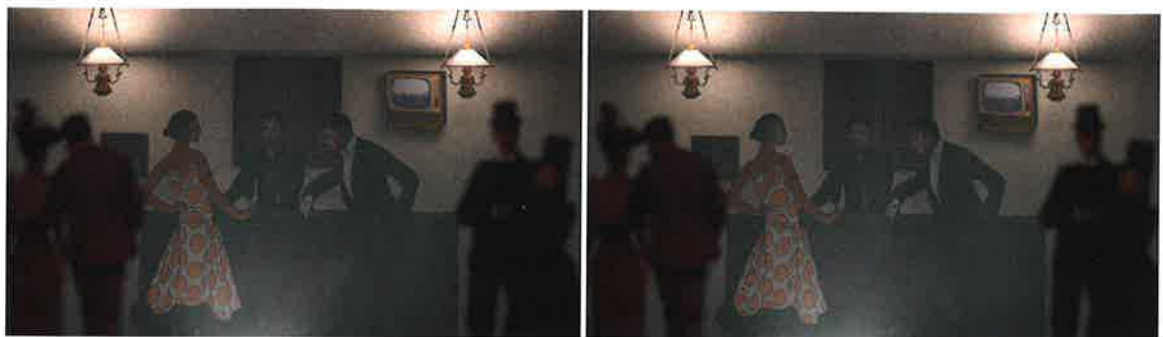
Still from The Problem With Friends.